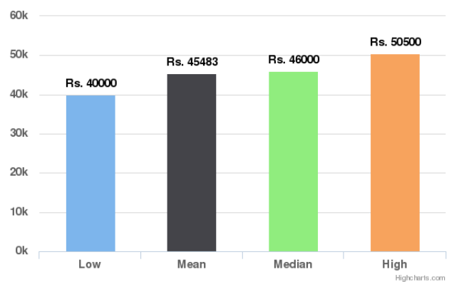
Similar Orders for Lifetime