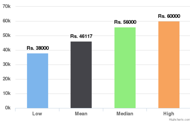
Similar Listings for Past 90 days