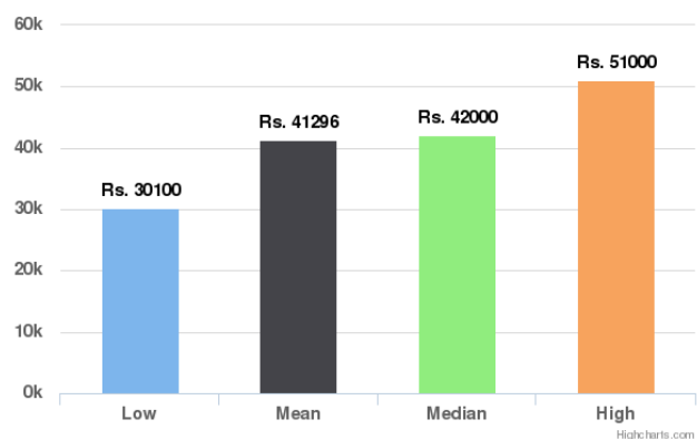
Similar Orders for Lifetime