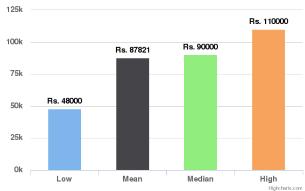
Similar Orders for Lifetime