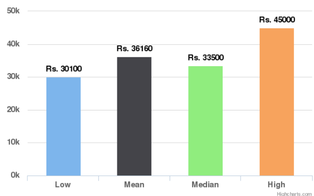
Similar Orders for Lifetime