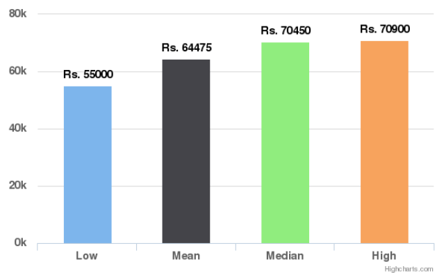
Similar Orders for Lifetime