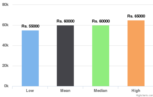
Similar Listings for Past 90 days