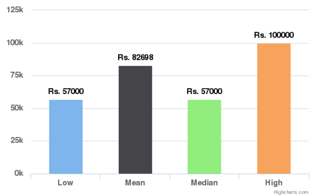
Similar Orders for Lifetime